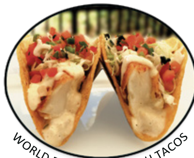
WORLD FAMOUS BAJA FISH TACOS